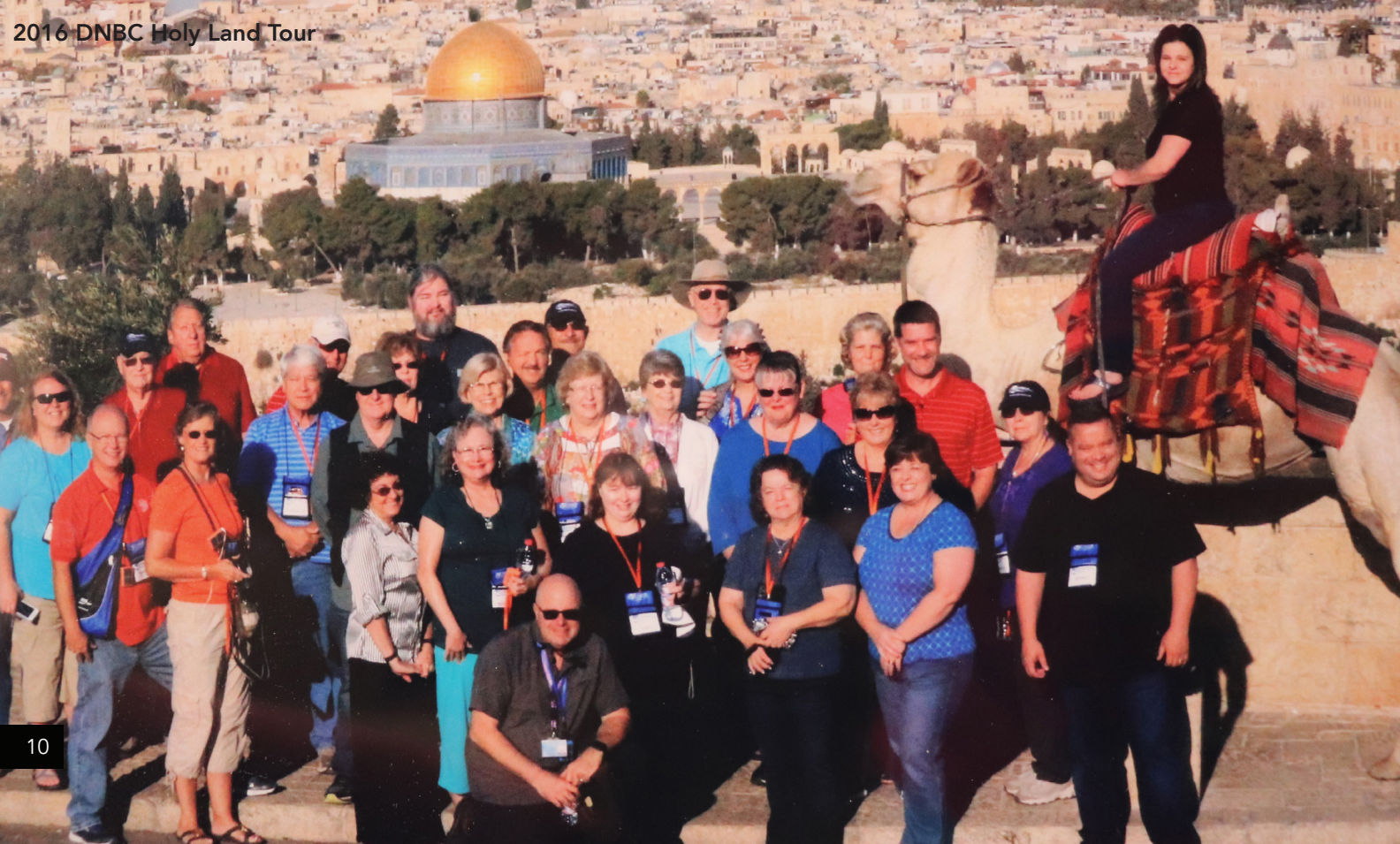
2016 DNBC Holy Land Tour