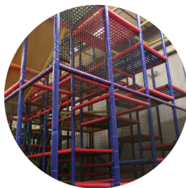
Hoots August 10th

All New Children's Ministry website up and running now!