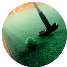
Putt-Putt June 22nd

Times and all other details to be determined (check the website for updates!) All 3 events $12 per person. Tickets available NOW!!