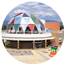
Explora July 27th