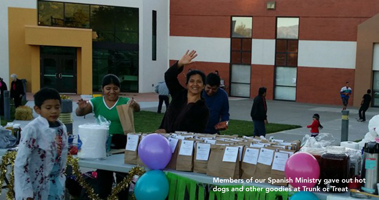
Members of our Spanish Ministry gave out hot dogs and other goodies at Trunk or Treat